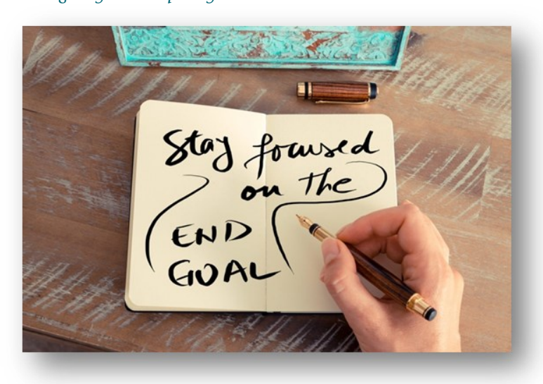
"Make disciples of all the nations." (Matthew 28:19 NIV)

Navigate your journey with resilience, grit, and vision — remain goal-focused, path-flexible.